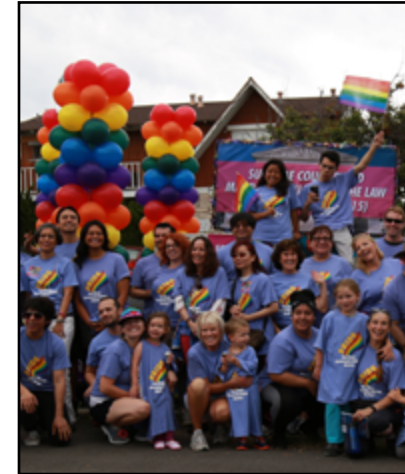
2015 San Diego Pride Parade