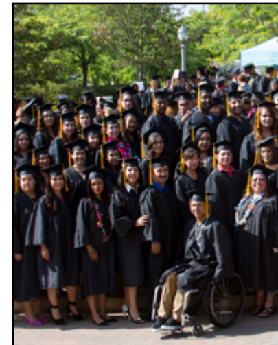
2015 Continuing Education graduates

In May 2015, the SDCCD colleges and Continuing Education had the largest number of graduates in the District's history