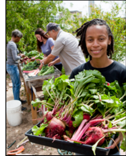
San Diego City College Seeds Urban Garden

24 SDCCD facilities have been awarded LEED certifications: