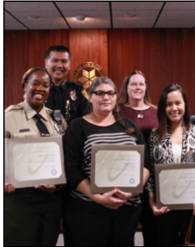
2015 Classified Employee Service Awards

SDCCD Online Learning Pathways trained a total of 1,156 faculty in the use of Blackboard and online pedagogy