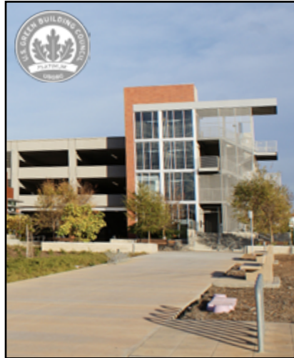
Miramar College Police Station 2015 LEED Platinum Certification