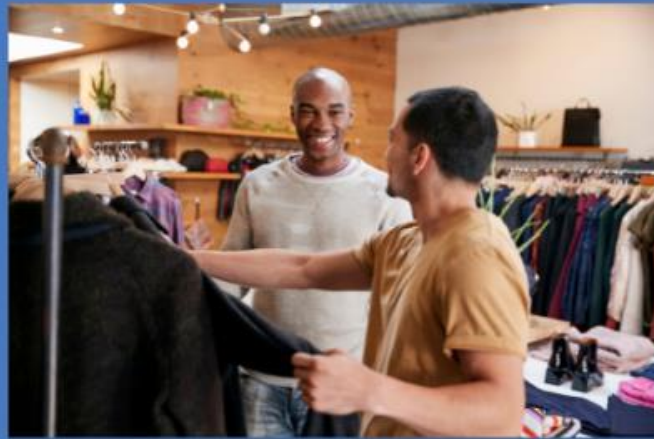
Assistance with employment or training related fees