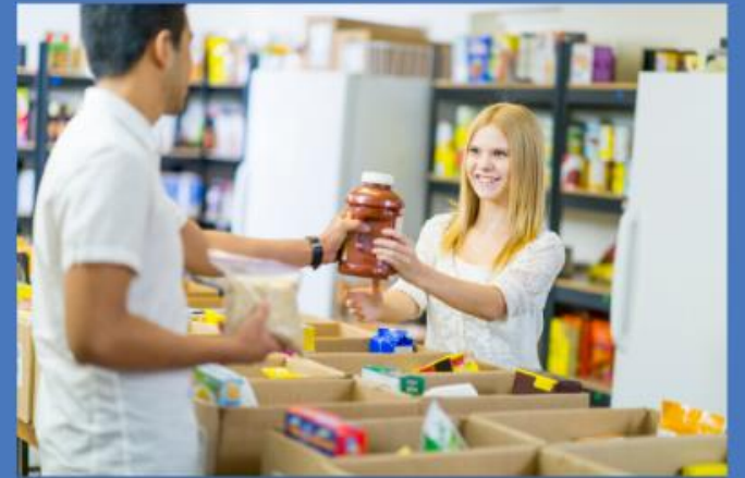
Linkages to community services