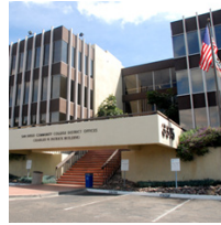
District Office 3375 Camino Del Rio South San Diego, CA 92108-3883