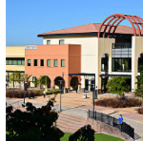
Miramar College 10440 Black Mountain Road San Diego, CA 92126-2999